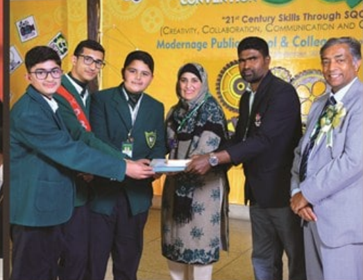
(Debates, Radio Jockeying, 60 Sec Filmmaking & Paper Presentations)