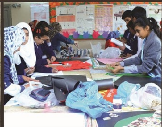
(Case Study Presentation, Collage Competition, Quiz and Robotics & Gaming Training)